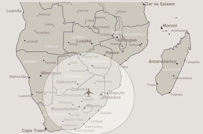
SUPERVAN 900 RANGE OUT OF LANSERIA

*based on average winds from doors shut to doors open