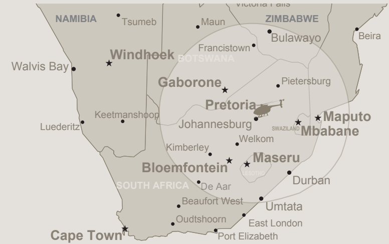
BELL 230 RANGE OUT OF LANSERIA

*based on average winds from doors shut to doors open