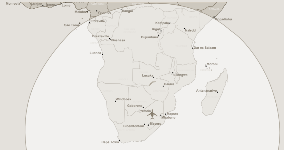
LEARJET 60 RANGE OUT OF LANSERIA

This map is a schematic representation only.