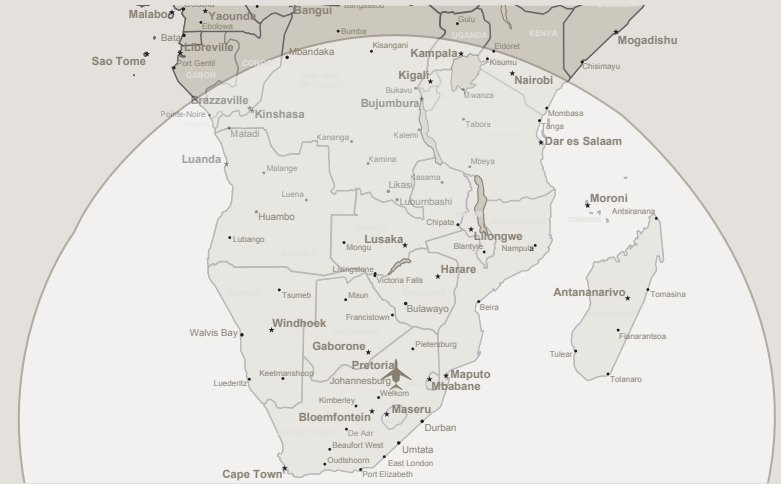
LEARJET 45 RANGE OUT OF LANSERIA

*based on average winds from doors shut to doors open