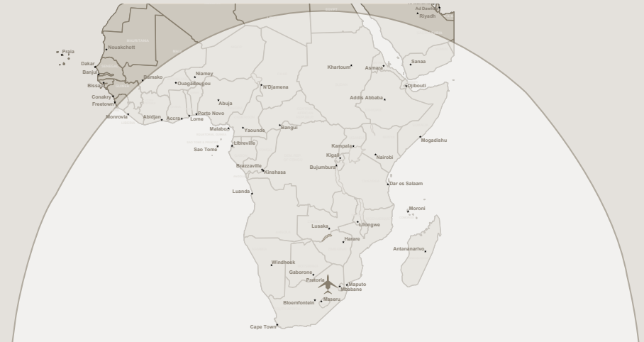
HAWKER 4000 RANGE OUT OF LANSERIA

This map is a schematic representation only.