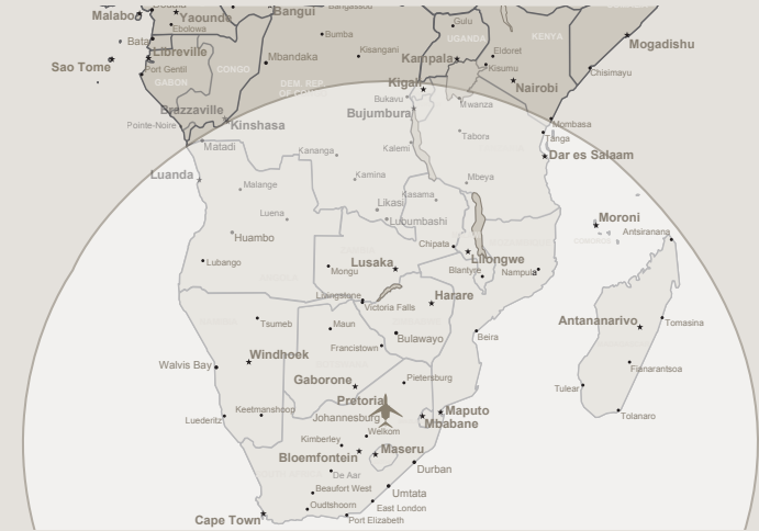
KING AIR B200 RANGE OUT OF LANSERIA

*based on average winds from doors shut to doors open