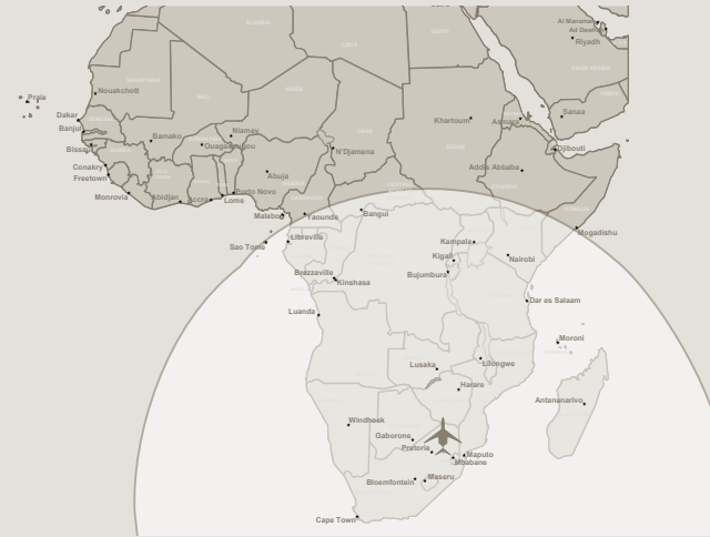
NEXTANT 400 XT RANGE OUT OF LANSERIA

*based on average winds from doors shut to doors open