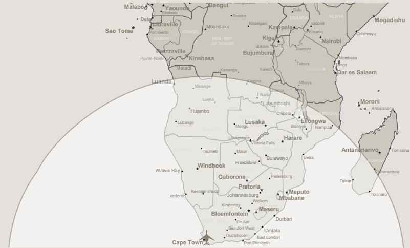
PILATUS PC-12 RANGE OUT OF CAPE TOWN

This map is a schematic representation only.