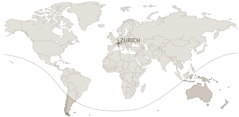
GLOBAL 6000 RANGE OUT OF ZURICH

This map is a schematic representation only.