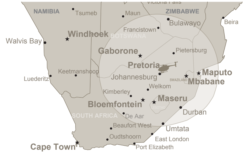
BELL 430 RANGE OUT OF LANSERIA

This map is a schematic representation only.