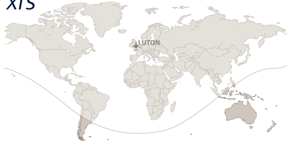
GLOBAL EXPRESS XRS RANGE OUT OF LUTON

This map is a schematic representation only.