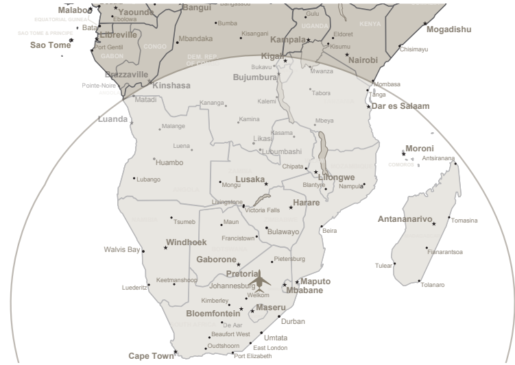
KING AIR B200 RANGE OUT OF LANSERIA

This map is a schematic representation only.