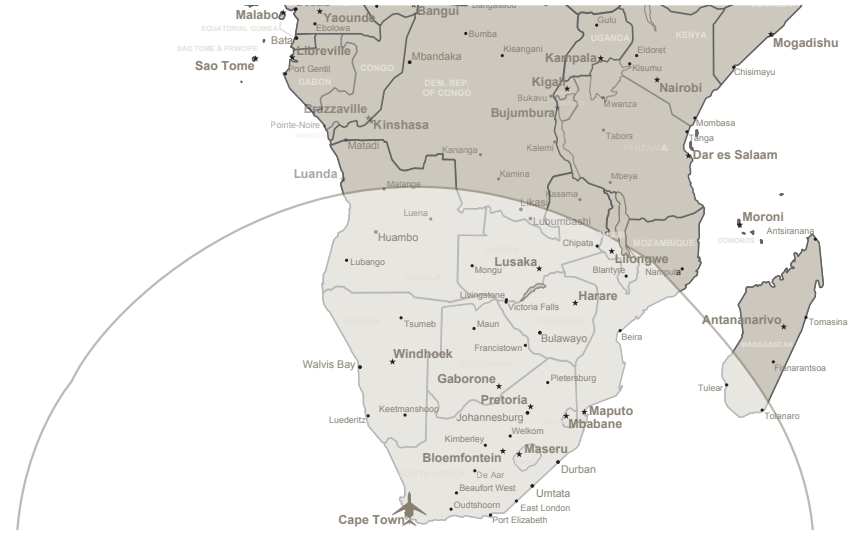
KING AIR B200 RANGE OUT OF CAPE TOWN

This map is a schematic representation only.