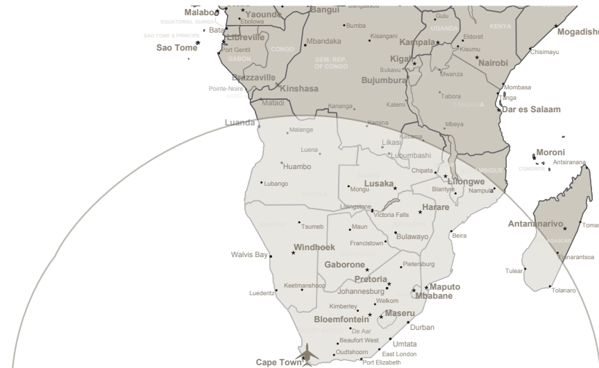
PILATUS PC-12 RANGE OUT OF CAPE TOWN

This map is a schematic representation only.