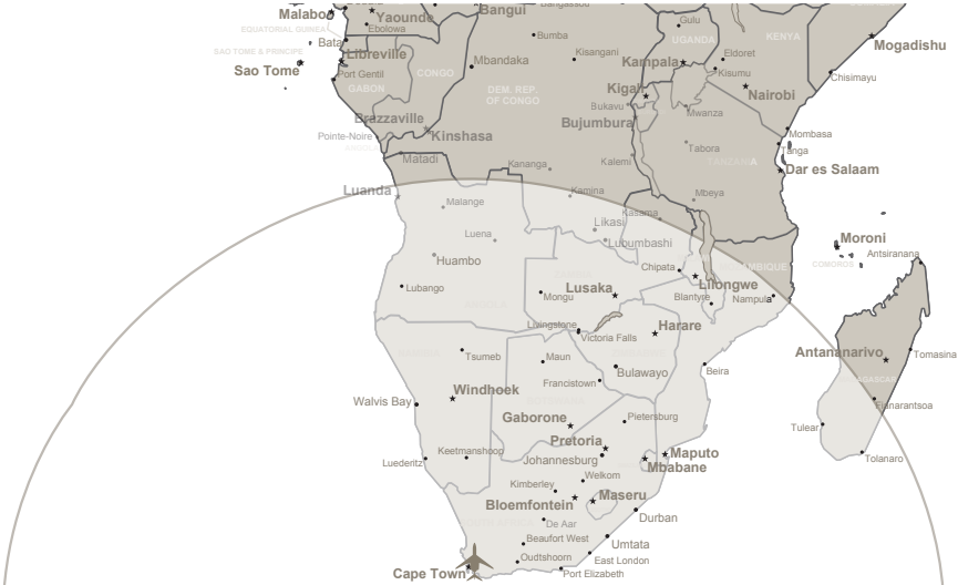
PILATUS PC-12 RANGE OUT OF CAPE TOWN

This map is a schematic representation only.