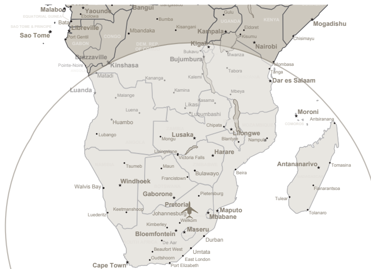
KING AIR B200GT RANGE OUT OF LANSERIA

This map is a schematic representation only.