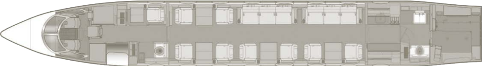
GULFSTREAM G650 CABIN CONFIGURATION