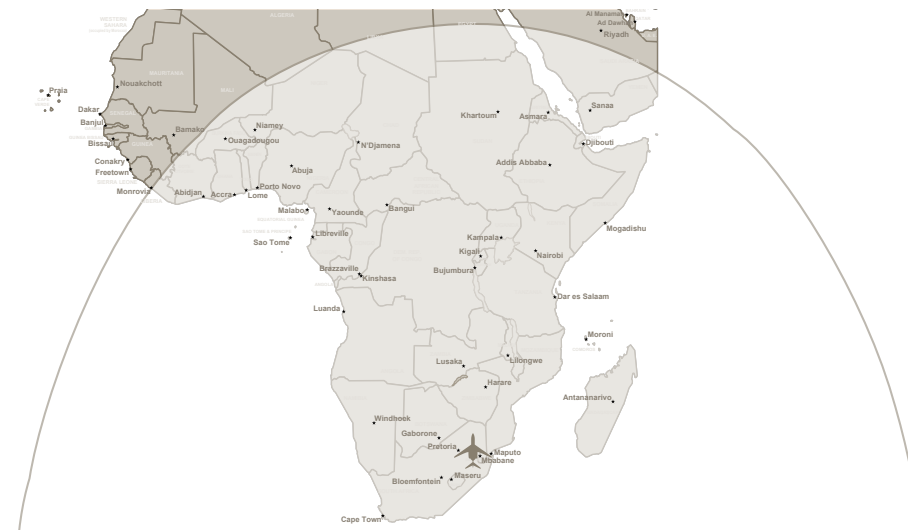
FALCON 50EX RANGE OUT OF LANSERIA

This map is a schematic representation only.