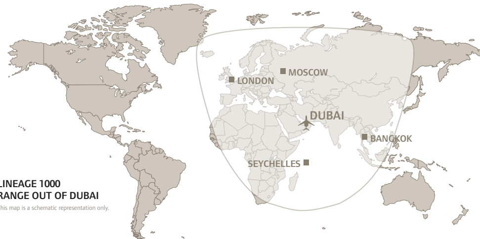
LINEAGE 1000 RANGE OUT OF DUBAI

This map is a schematic representation only.