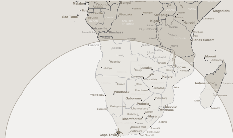
KINGAIR 350i RANGE OUT OF CAPE TOWN

*based on average winds from doors shut to doors open