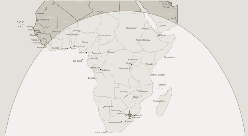
CHALLENGER 350 RANGE OUT OF LANSERIA

*based on average winds from doors shut to doors open