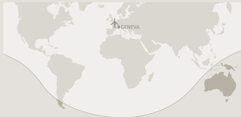
GULFSTREAM G650 RANGE OUT OF GENEVA

This map is a schematic representation only.